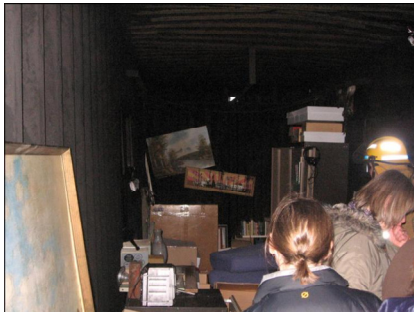
The container, before